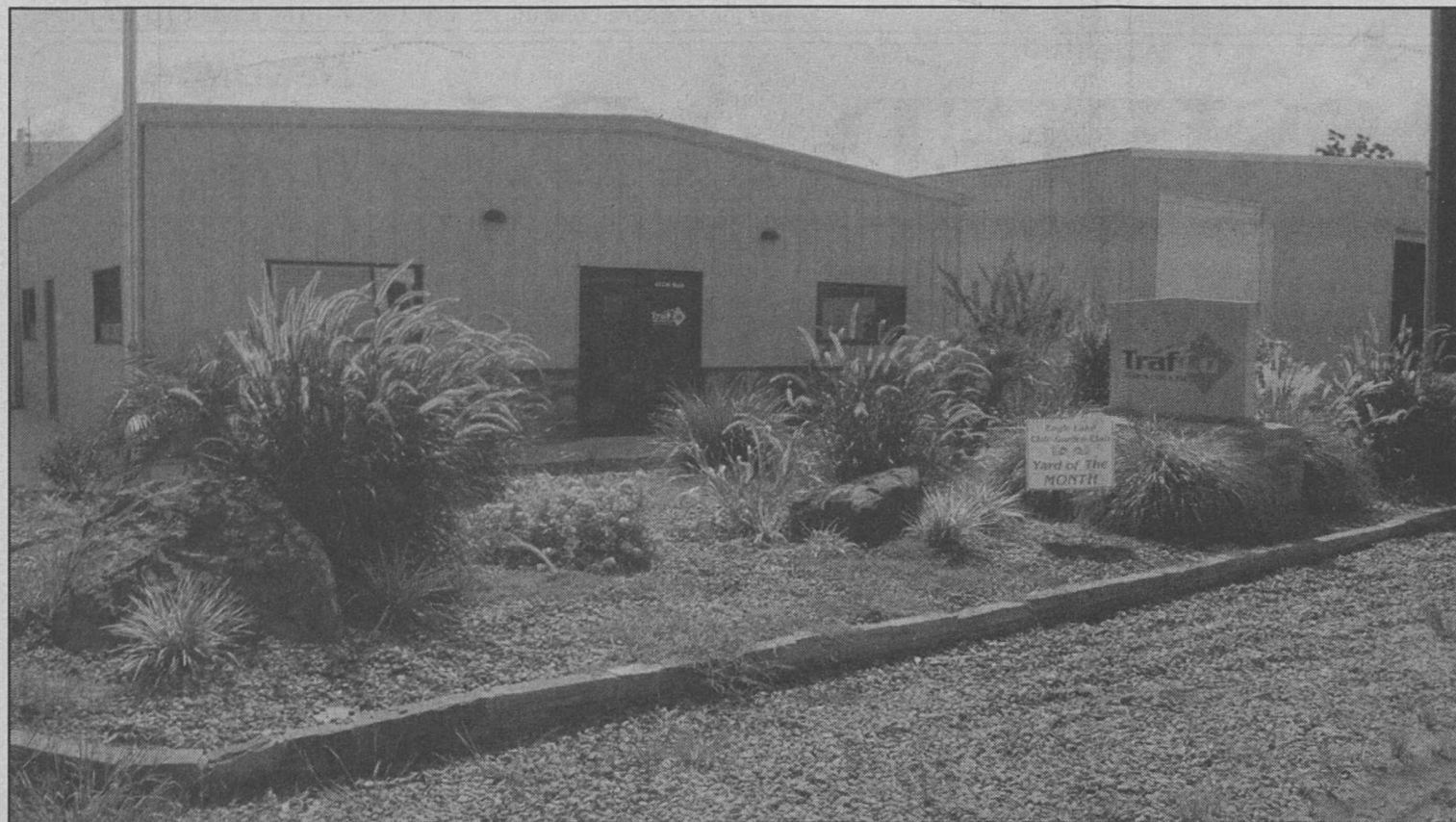
TrafCo Industries, Inc. at 414 West Main is the Eagle Lake Civic Garden Club's Yard of the Month for August.